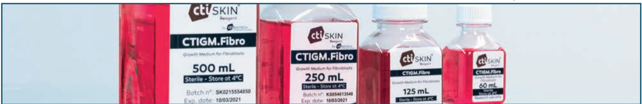
GROWTH MEDIUM Fibro GROWTH MEDIUM Kerat GROWTH MEDIUM Sebo GROWTH MEDIUM Melano GROWTH MEDIUM Adipo GROWTH MEDIUM PBMC