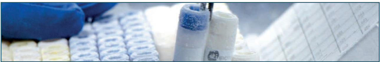
CRYOTUBE Fibro CRYOTUBE Kerat CRYOTUBE Sebo CRYOTUBE Melano CRYOTUBE Adipo CRYOTUBE PBMC